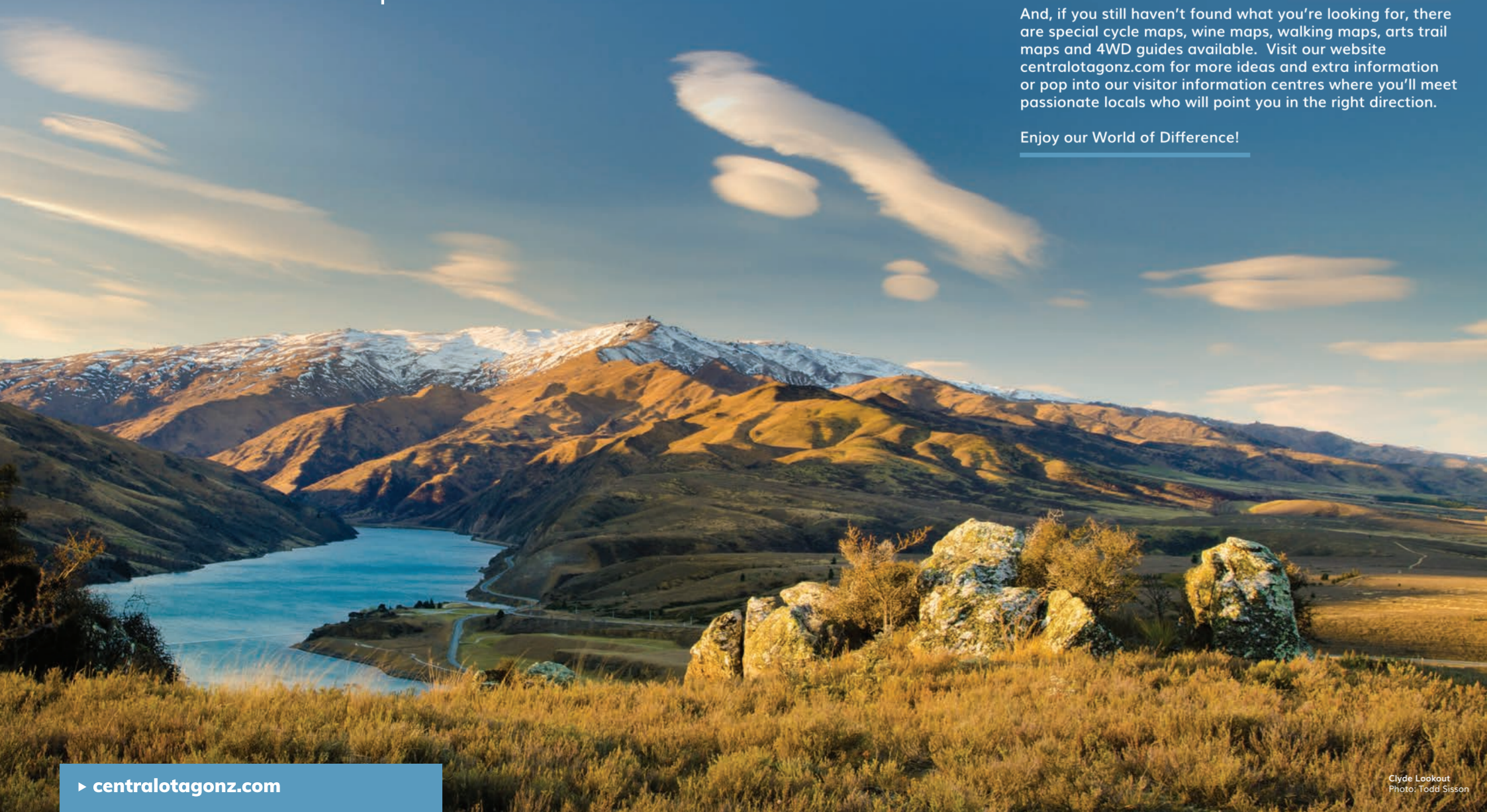
Clyde Lookout