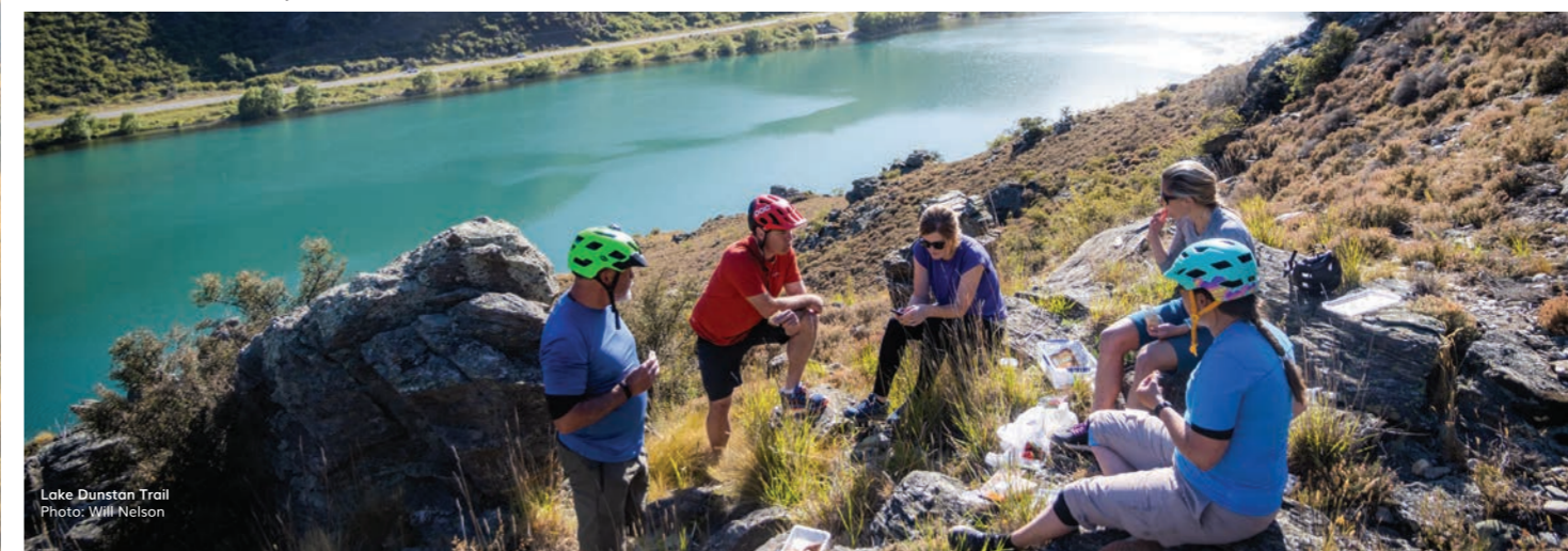
Lake Dunstan Trail